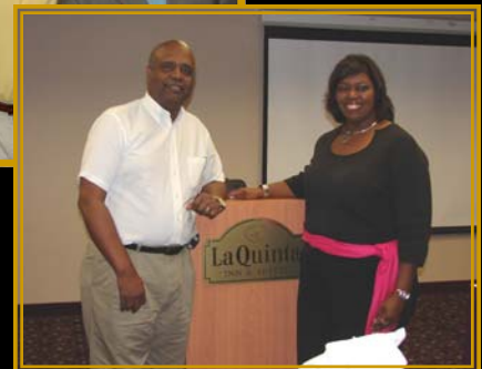
Photos from the Chapter meetings in Houston, Texas