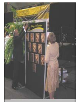
The 2008 AHOF Committee

The Alumni Hall of Fame Committee will meet soon to start planning for 2008 Hall of Fame Banquet scheduled for October 17, 2008. Check back often on Alumni or Grambling websites to find out when nominations open for the next class. Your prompt response will be appreciated.