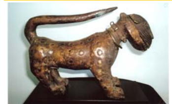
Aboriginal Indigenous Art