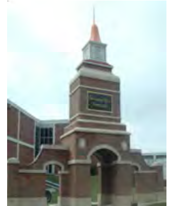
New GSU Entrance