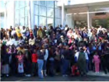
Spectators watch the 2007 GSU Homecoming Parade coming down Main Street. Children, young and older adults scramble for candy thrown to them by participants riding in floats, cars or motorcycles.